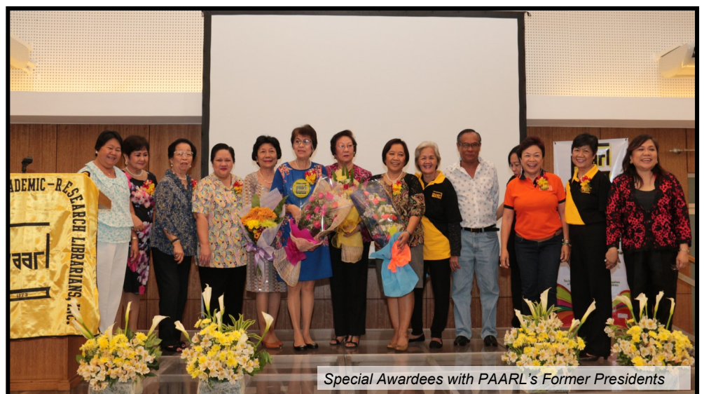
Special Awardees with PAARL's Former Presidents