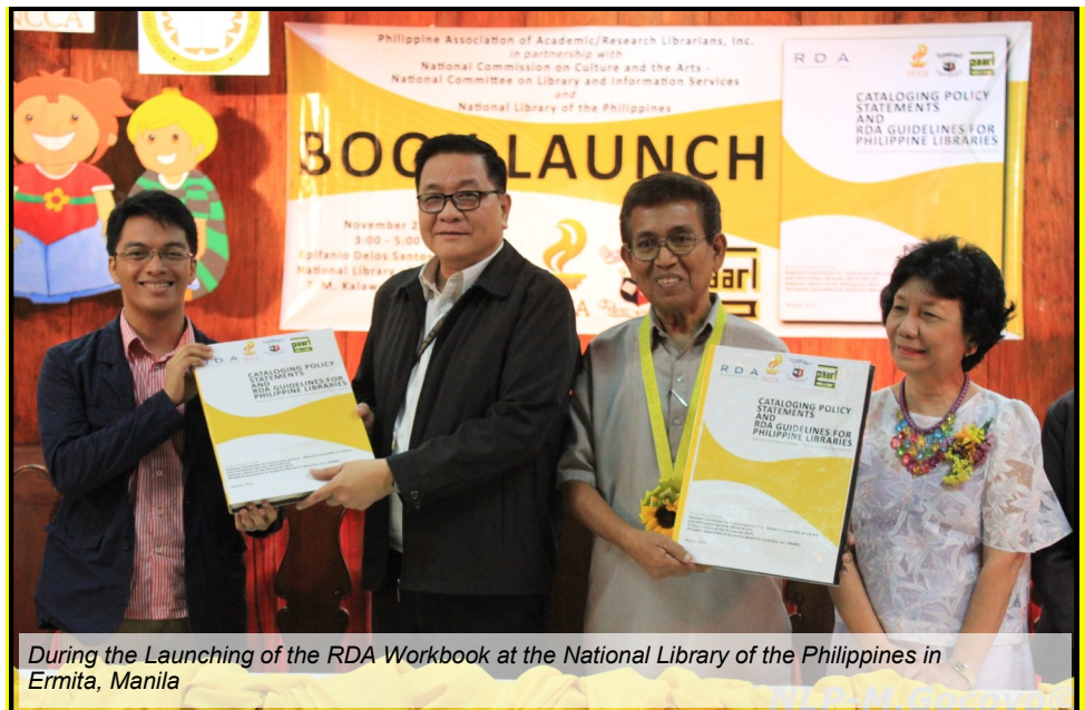
During the Launching of the RDA Workbook at the National Library of the Philippines in Ermita, Manila

At the start of 2014, PAARL hosted a fund-raising event at the UP College of Engineering Library. This one time gathering was conceptualized instead of soliciting support every time that there is a PAARL activity. It was also a venue to treat our